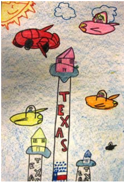
Texas is Back by Virginia Casteneda