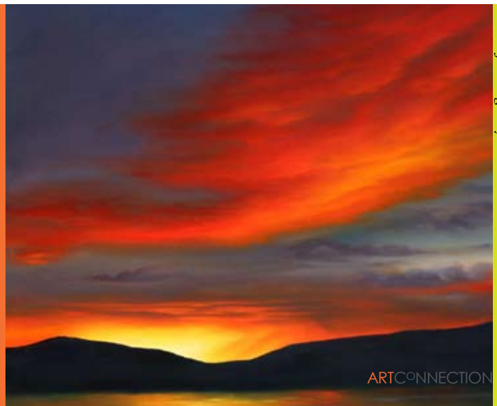
Last of the Light by Dawn Waters Baker