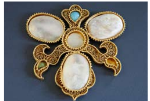
Queen's hat ornament, National Museum of Mongolian History