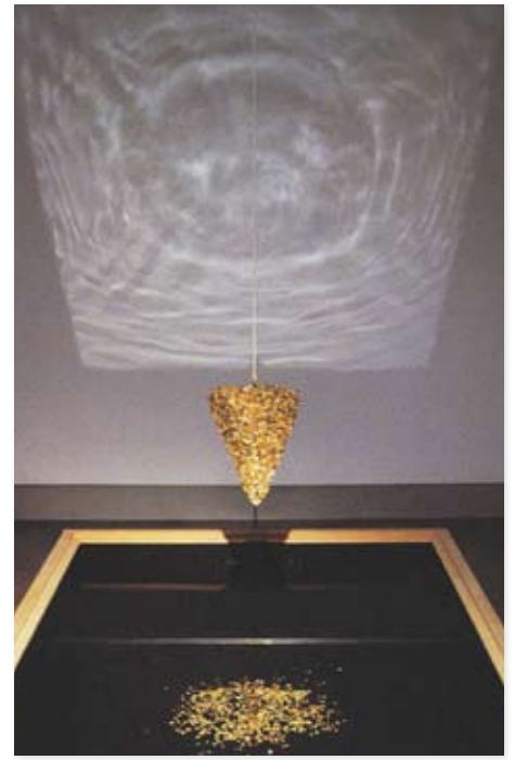
Remembering Plato by Mineko Grimmer

Exhibition features a site-specific installation by Los Angeles-based artist Mineko Grimmer. Grimmer's sculptures are large-scale musical "instruments." She creates structures from bamboo, piano wire and other objects and then suspends frozen pebbles above the installation. As the pebbles melt, they fall through the sculpture creating a medley of sounds.