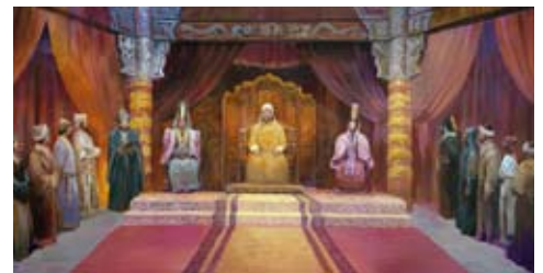
Kublai Khan's palace court