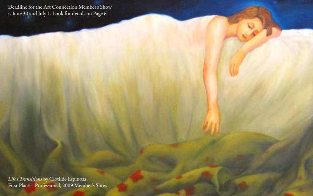
Life's Transitions by Clotilde Espinosa, First Place – Professional, 2009 Member's Show

Deadline for the Art Connection Member's Show is June 30 and July 1. Look for details on Page 6.