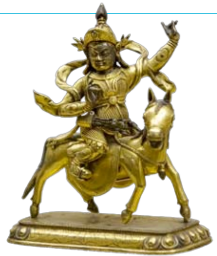
Buddha god of war, National Museum of Mongolian History

More on Genghis Khan, continued on Page 9.