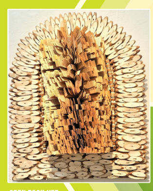
OPEN BOOK, VET ( 2020 ACMS BEST OF SHOW)

THIS ANNUAL, NON-JURIED EXHIBITION IS OPEN TO ALL CURRENT WISH TO PARTICIPATE. THE ENTRY FEE IS $5 PER SUBMIT UP TO TWO PIECES. ELIGIBLE AWARDS IN THREE CATEGORIES: YOUTH, NON-PROFESSIONAL AND PROFESSIONAL. AN OVERALL "BEST OF SHOW" PRIZE WILL ALSO BE AWARDED