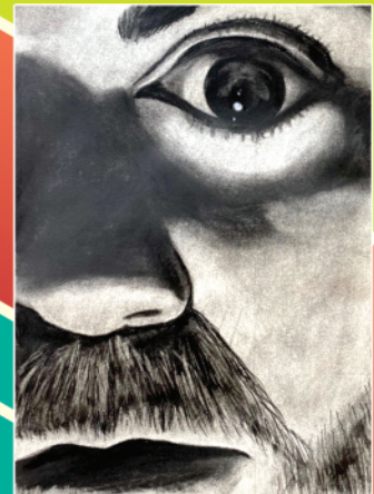
WHAT DAY IS IT? QUARANTINE SELF PORTRAIT BRETT DYER