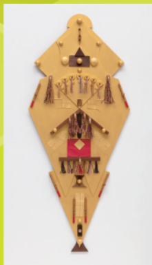
SLENDER REGAL KITE GISELA-HEIDI STRUNCK