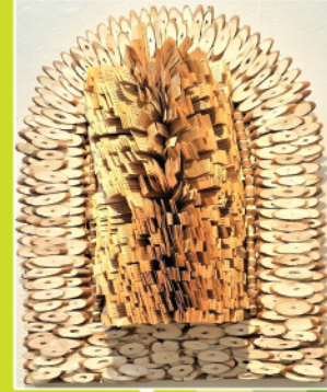
OPEN BOOK, VET (2020 ACMS BEST OF SHOW)